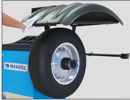
Automatic start with closing of wheel guard, helps in quick balancing process.