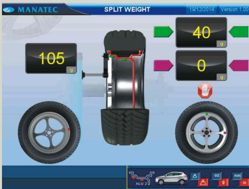
Split weight program (spokes program) helps to split the weight to be hidden behind the spokes of the alloy wheels.