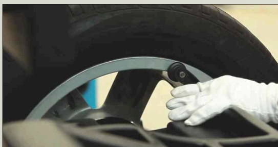
Automatic distance & rim diameter input through distance measuring rod.