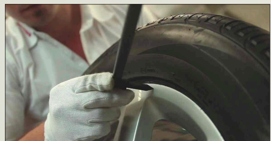
Automatic rim width measurement.