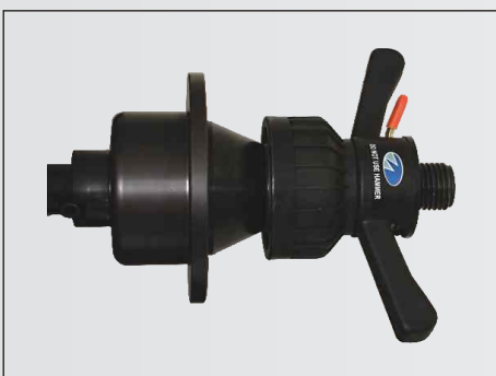
Mid centering device for positioning of wheels accurately at center of the rotor assembly. Quick Change Lock Nut (QCLN) to ensure fast mounting and removal of wheel.